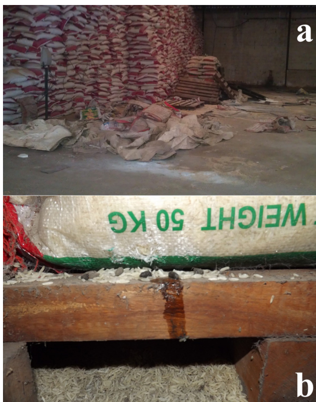
Figure 2. Images de l'intérieur des entrepôts du Port Autonome de Cotonou avec (a) des piles de sacs de riz, (b) du riz jonchant le sol et des fèces et de l'urine de rongeurs — Pictures of inside Cotonou seaport storehouses showing (a) rice bags piles, (b) wasted rice on the floor as well as rodent urine and feces.

Four dock warehouses (120 x 80 m), all located in AHC zone 1, were selected for the evaluation of rodent-induced economic loss due to damages to stored food. Three of them were public infrastructures (warehouses wh1, wh2 and wh3; Figure 1 ), with poor light and floors covered with cotton and rice wastes (see Figure 2 ). Rodent dead bodies were visible and rodent feces were numerous. In these buildings, rice bags were stacked on pallets, thus leaving a space between the floor and the goods piling as well as between wooden boards of the pallets. Piles are up to 7 m high and located around 1 m away from the walls. The fourth warehouse (wh4) was managed by a private company and looked cleaner, with less waste and no