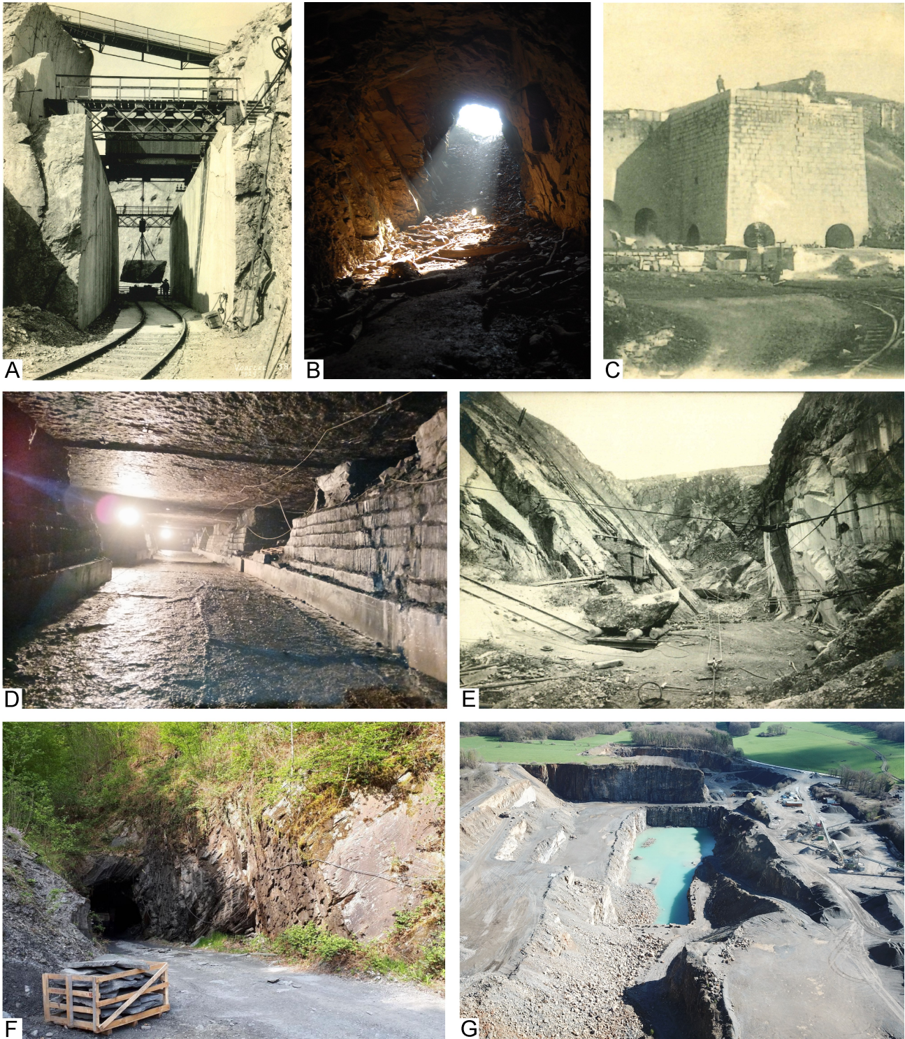
Figure 3. The past and ongoing stone industry in the Devonian of southern Belgium. A. Hautmont marbre rouge quarry, Vodelée, 1929 (courtesy of Pierres et Marbres de Wallonie). B. Wierde ironstone mine, active between 1855 and 1869. C. Lime kiln at Jemelle, early 20th century (courtesy of Pierres et Marbres de Wallonie). D. Mazy marbre noir underground quarry at Mazy, the only underground ‘marble’ quarry still ongoing nowadays in Belgium. E. Marbre Sainte-Anne quarry at Gournies, 1920s (courtesy of Pierres et Marbres de Wallonie). F. Entrance of the Alle slate underground quarry. G. Aerial view of the Marenne quarry, extracting Givetian limestone for aggregate production, 2023 (courtesy of Jean-Marc Marion).