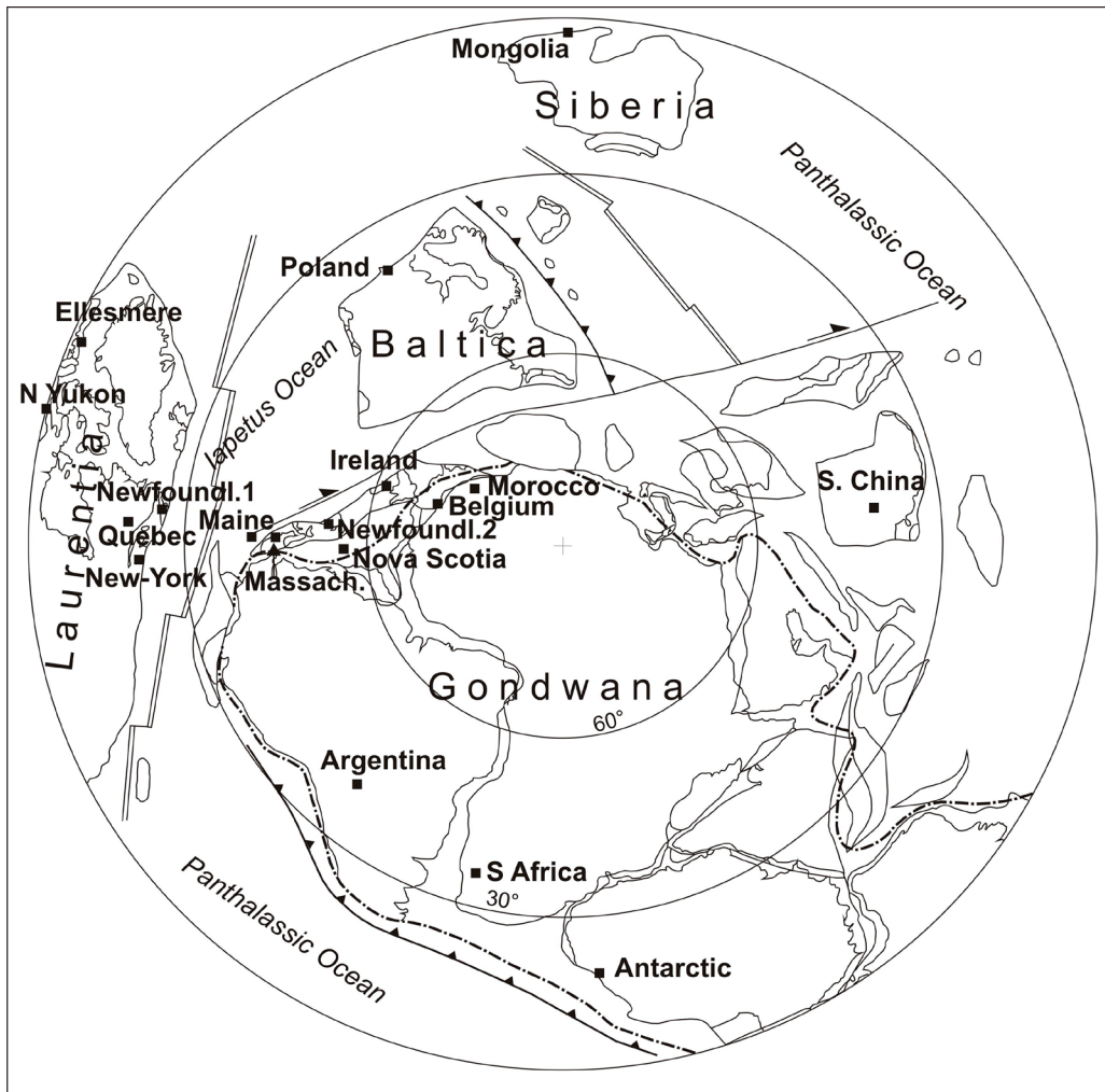
Figure 3. Distribution of Oldhamia occurrences on a palaeogeographic reconstruction at the boundary between middle and upper Cambrian at about 500 Ma (modified after Cocks & Torsvik, 2002). The approximate position of Mongolia is after Cocks & Torsvik (2007). The position of Nova Scotia (Meguma) between Gondwana and Avalonia is after Waldron et al. (2009 fig. 3). Belgium has two occurrences (Brabant Massif and Deville Group). Newfoundland 1 and 2 corresponds respectively to Blow Me Down Brook and Cuslett formations. The doubtful occurrence in Spain is not drawn.