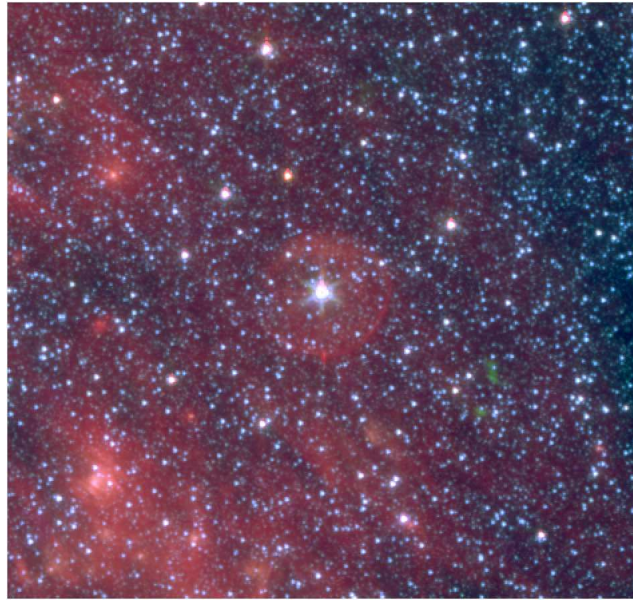
Figure 1: IRAC composite image of Wray 17-96 with north up and east to the left, FOV = 5'' . Emission from the central star is evident at 3.6\mu\text{m} (blue), while the warm dust is well traced by the 8.5\mu\text{m} (red)