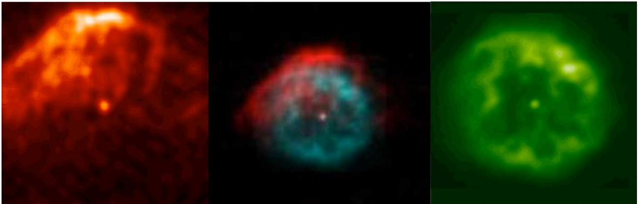
Figure 2: Center: multi-configuration 6-cm VLA map (red) superimposed on the 11.26- \mu\text{m} VISIR map (blue) of IRAS 18576+0341. Both maps have north up and east to the left. The center image is 20'' across. A zoomed (FOV 8'') of the VLA map (left) and of the VISIR map (right) are also shown (adapted from Buemi et al. 2010).

Many interesting results have been obtained from our imaging and spectroscopic program. In particular, extended dusty shells have been detected around some of our targets (see Fig. 1) and evidence for asymmetric mass-loss and of possible mutual interaction between gas and dust components is suggested by the comparison of VLT/VISIR and VLA images of the more compact nebulae. The analysis of the mid-IR spectra has provided information on the gas and dust composition, allowing identification of the mineral composition of LBV ejecta and to discriminate between crystalline or amorphous dust components. Moreover, the presence of low-excitation atomic fine structure lines points out the existence of a photodissociation region (PDR), an extra component of neutral/molecular gas that should be taken into account when one determines the total budget of mass lost by the star during its LBV phase. We present examples of our results in the following sections. More details can be found in a series of papers devoted to the project.