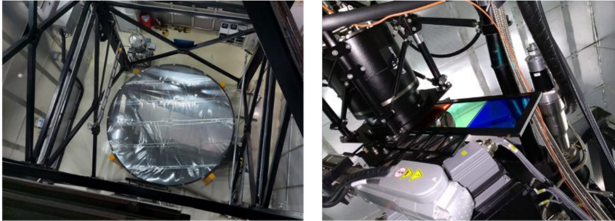
Figure 2: ( Left ) Top view of the ILMT structure and mirror filled with mercury and covered with mylar. ( Right ) The g , r and i Sloan filters installed in a tray just below the Spectral Instruments CCD camera.

variability studies of the strip of sky it observes. While the ILMT mirror is rotating, the linear speed at its rim is about 5.6 km/hr, i.e., the speed of a walking person.